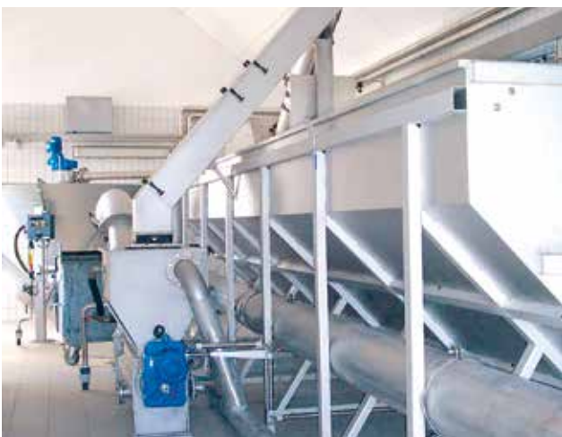
Intensive washing of screenings in a WAP® SL subsequent to a HUBER Complete Plant ROTAMAT® Ro5.