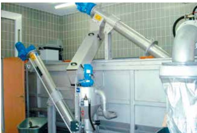
Classifying screw with subsequent HUBER Coanda Grit Washer RoSF4 T.

The settled grit is collected from the bottom of the grit channel with a horizontal grit screw. An inclined grit screw conveys, agitates and dewateres the collected grit. The classified grit slides from the upper end of the inclined screw into a HUBER Coanda Grit Washer RoSF4 T. Optionally, the material can be pumped to the grit washer.