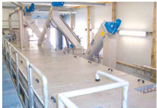
Complete Plant with integrated Grit Washer.

Due to a defined introduction of upwardly directed service water the grit situated within the lower part of the grit washer is fluidised within the flow enabling the lighter organic particles to be separated from the dense grit particles. The separation of the lighter organic particles from the dense grit particles is supported by a rabble rake. After removal of the organic material the clean grit is automatically removed by a classifying screw, statically dewatered and discharged into a container.