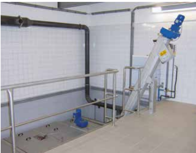
Integrated grit washing at the end of the HUBER Complete Plant ROTAMAT® Ro5.