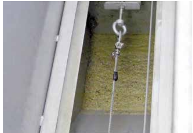
Paddle scraper for grease removal from the grease trap. According to the principle of a longitudinal grit removal scraper the grease paddle pushes the floating fat and grease into the pump sump.

chamber by the aeration system transports the grease through the slotted scum board into the grease chamber. In contrast to many competitors, the floating fats and oils are skimmed off the water surface with a paddle scraper that is slowly pulled with a stainless steel rope. The paddle is shaped so that it removes virtually all floating matter from the grease trap. Anaerobic degradation of fat and grease, and there-with odor nuisance, is thus prevented.