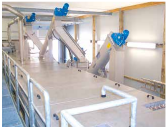
Odour-encased screenings discharge from the HUBER Complete Plant ROTAMAT® Ro5.