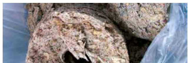
Washed and compacted screenings – the ideal fuel.

Solids concentration of screenings, depending on the WAP® type used: up to 50% DS.