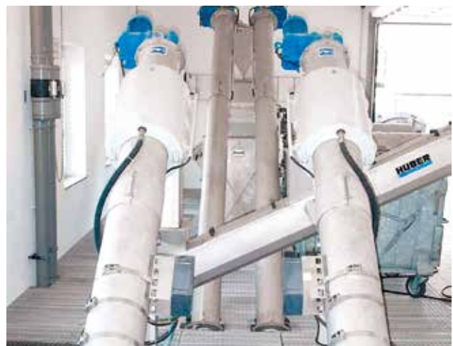
Underground, redundant HUBER Complete Plant ROTAMAT® Ro5.