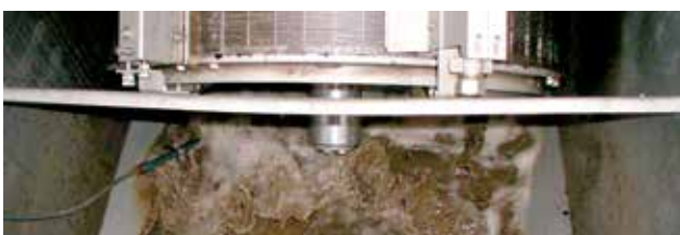
Well-proven wastewater fine screen: HUBER Rotary Drum Fine Screen ROTAMAT® Ro2.

Other separation sizes can be supplied on demand. Separate brochures are available for all of these machines.