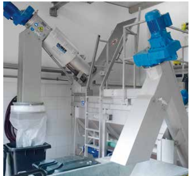
HUBER Complete Plant Hydro Duct ROTAMAT® Ro5 HD with integrated grit washer.